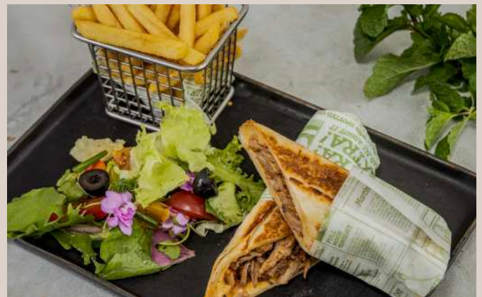
BBQ PORK WRAP - Rs. 2,888 Slow cooked pork in BBQ sauce, cucumber tomato salad, mozzarella cheese and wrapped.