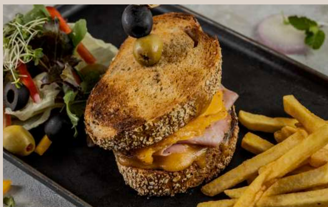
HAM AND CHEESE - Rs. 1,288