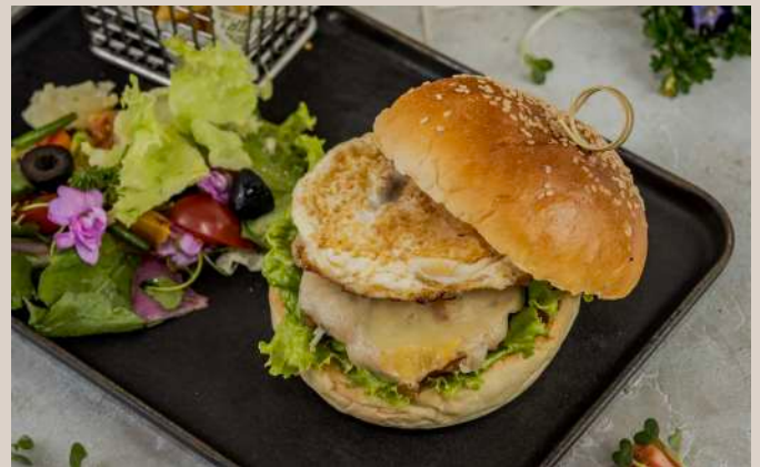
BLACK IRON CHICKEN BURGER - Rs. 2,488 Whole Cajun spiced marinated free range chicken thigh topped with cheddar cheese, fried egg, jalapeno and pimento drizzle.