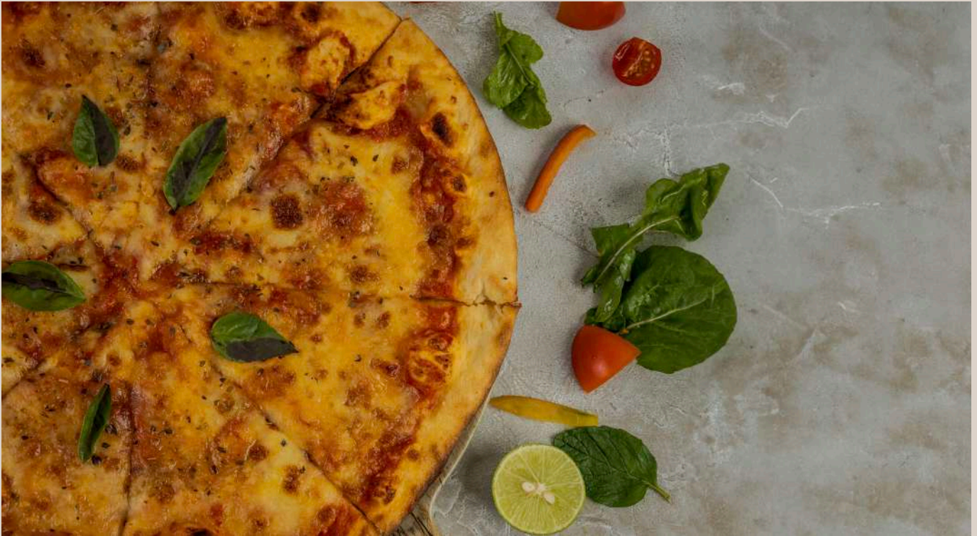
PIZZA MARGHERITA - Rs. 1,888 Tomato, basil & mozzarella cheese.

All prices are in Sri Lanka Rupees and exclusive of 10% service charge and government taxes