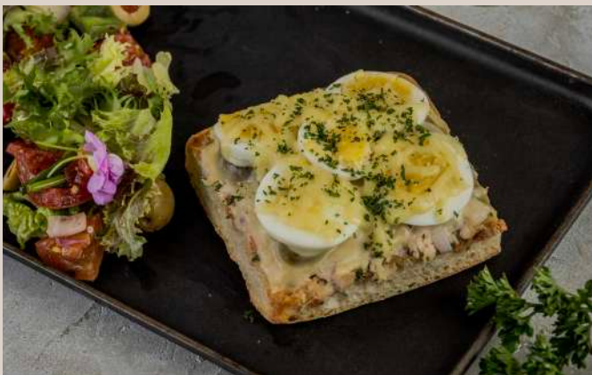
TUNA MELT - Rs. 2,888 Flaked tuna, jalapeno, sliced boiled egg and jack cheese in ciabatta.