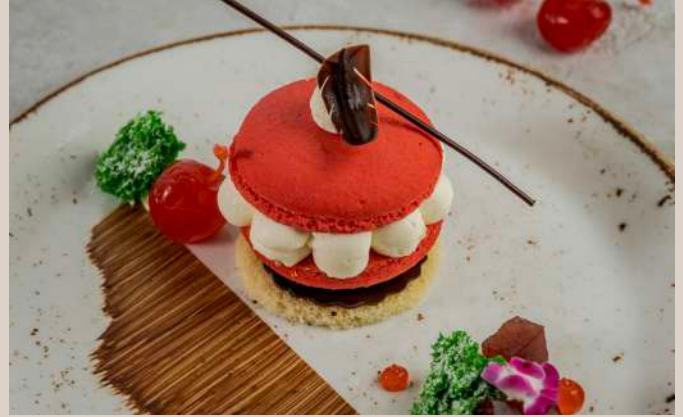
ROSE DE VENT - Rs. 1,688

Pear caramelized with spices with New York cheesecake, almond crumble.