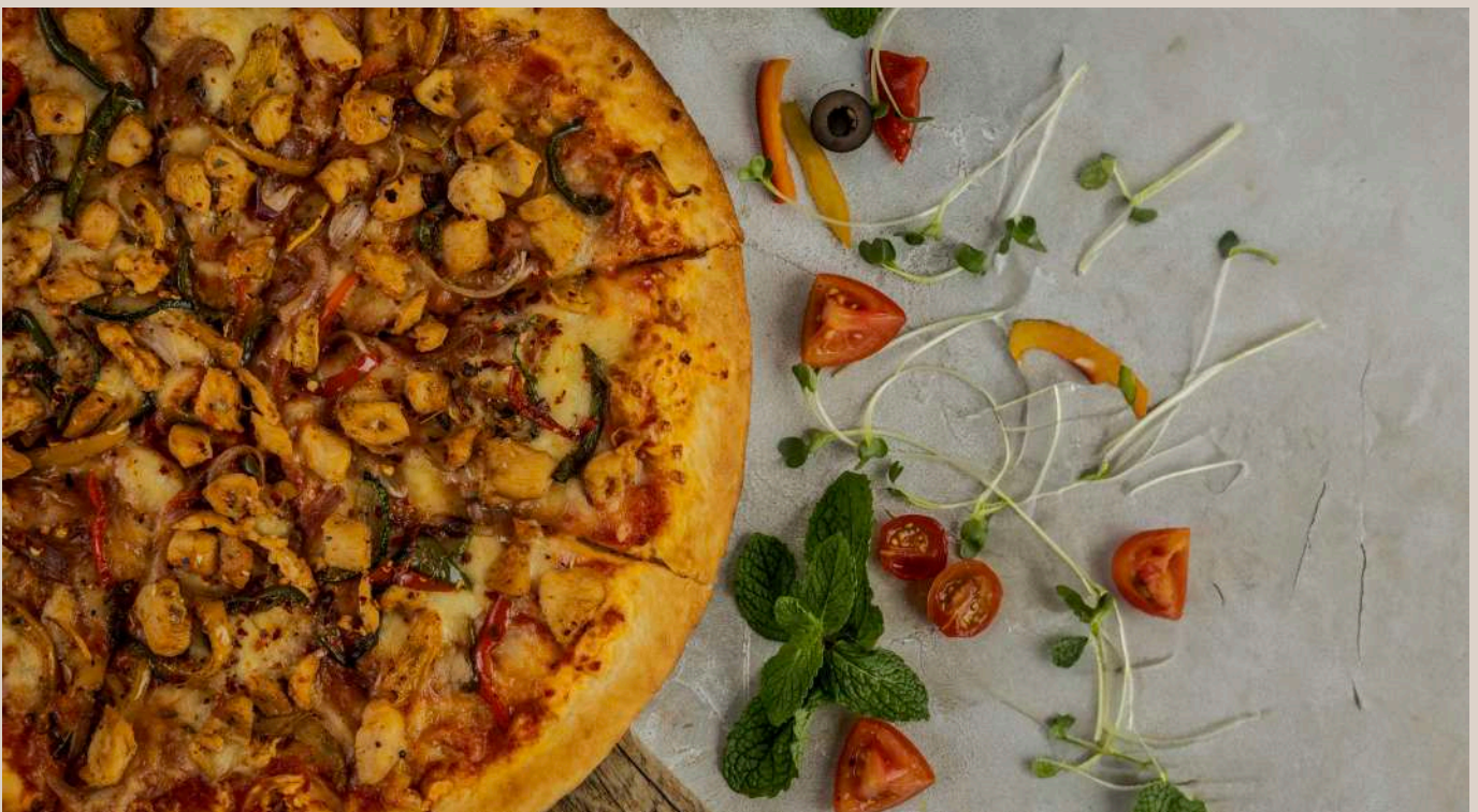
POLO PICANTE PIZZA - Rs. 2,588 Tangy tomato sauce, melted mozzarella, spicy chicken, onion & mushroom.