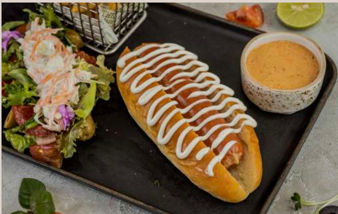
CAROLINA DOG - Rs. 1,088 Chicken bockwurst in hot dog bun with chili sauce and topped with slaw.