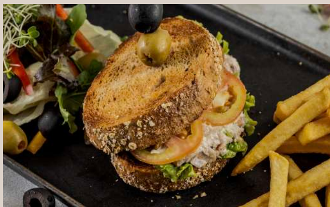
SPICY TUNA AND KOCHCHI - Rs. 1,888