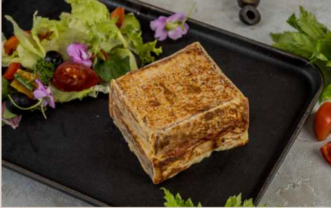
CROQUE MONSIEUR - Rs. 1,488 Toasted brioche, turkey ham and emmental cheese, Served with mixed greens.

Indulge in a sumptuous lunch experience at Cafe Kai, featuring a diverse selection of flavorful dishes crafted to perfection.