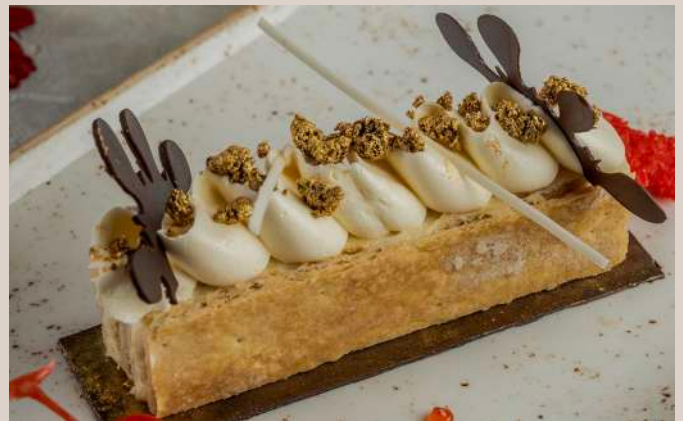
SALTED CARAMEL MILLE FEUILLE - Rs. 1,088

Royal manjari bitter mousse dark Harlem with espresso cardamom parfait.