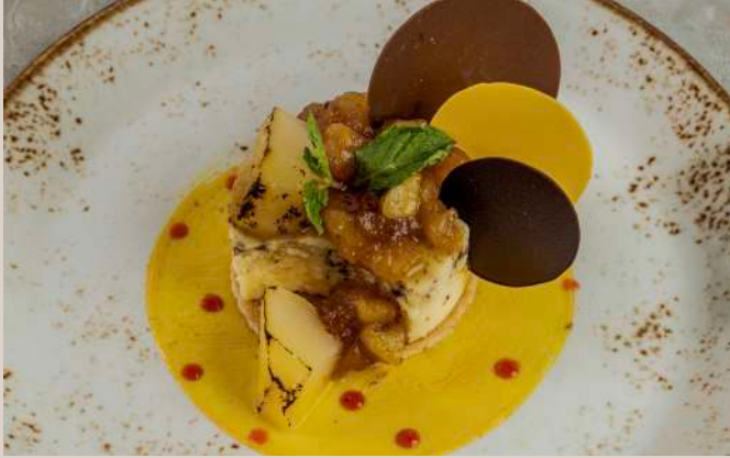
CARAMEL PEAR COBBLER CHEESECAKE - Rs. 1,288

Let your taste buds dance with joy as you savor our delightful dessert selection at Café Kai. Our chefs have artfully combined premium ingredients to create a symphony of tastes, ensuring that every spoonful is a moment of sheer indulgence.