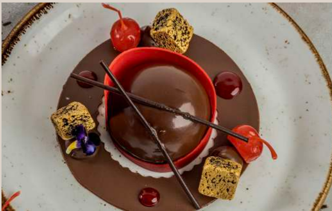
CHOCOLATE ESPRESSO CARDAMOM PARFAIT - Rs. 1,888

Strawberry macaroon with red berry compote, diplomat cream & fresh strawberry on top.