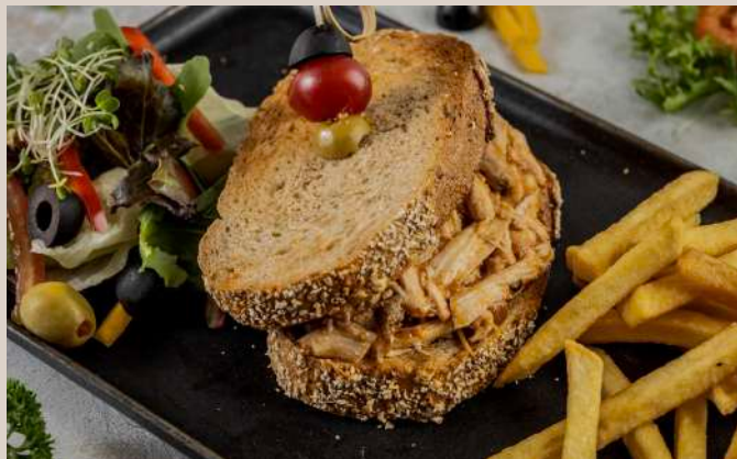
ROTISSERIE CHICKEN - Rs. 1,888

Select your choice of flavors to build up your sandwich in multi grain bread