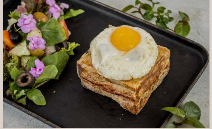
CROQUE MADAME - Rs. 2,488 Toasted brioche, turkey ham and emmental cheese topped with fried egg Served with mixed greens.