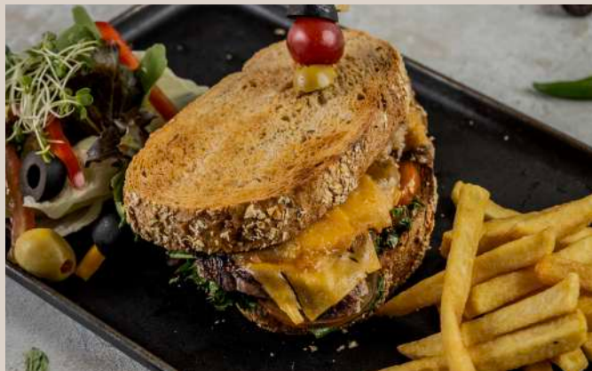
STEAK AND CHEESE - Rs. 2,588