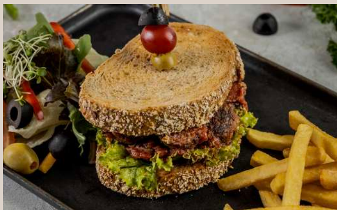
MEATBALL MARINARA - Rs. 2,988